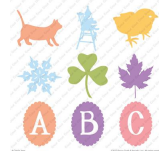
Cricut® A Child's Year Cartridge