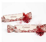
Winter Party Crackers