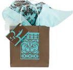
Gate Gift Bag