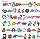
Hello Kitty® Greetings Cartridge