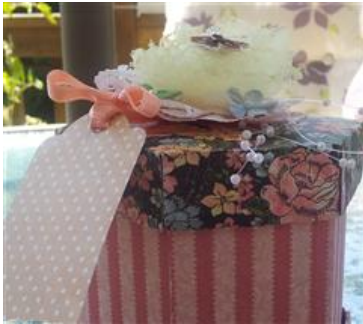
Hexagon Box using Graphic 45

I used the extra section of uncut paper and piece them together so you should end up with a piece that measures 4" by 15 inches. Use this to make the walls of the box.