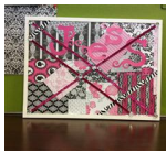
Easy DIY Bulletin Board.