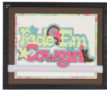
Ride 'Em Cowgirl Frame