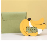
Thanks A Bunch Card