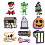
Cricut® Lite Cartridge, Trick or Treat