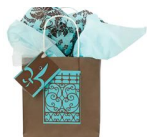
Gate Gift Bag