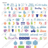
New Arrival Cartridge