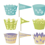
Cupcake Wrappers Cartridge