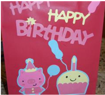
CAC2 Birthday Gift Bag

Assemble all pieces according to the Create A Critter 2 guidebook (Page 6). Attach assembled pieces to the front of a solid colored gift bag.