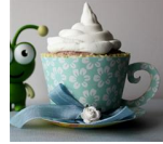
Tea Cup Cupcake Holder