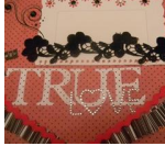
You are my True Love