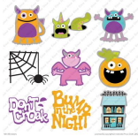
Mini Monsters Cartridge