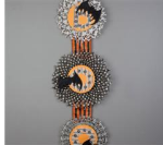
Boo Rosette Wall hanging