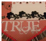
You are my True Love