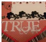
You are my True Love