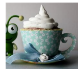
Tea Cup Cupcake Holder