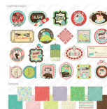
Cricut Imagine® Art Cartridge, Imagine More Cards