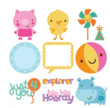
Create a Critter Cartridge