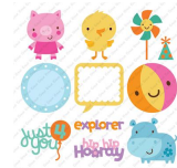
Cricut® Create a Critter Cartridge