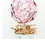
Mother's Day Centerpiece