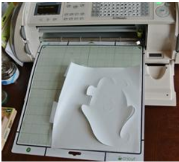
Cutting the Image

Using CCR and CAC2 I sized my image to fit a Toddler T-shirt. I taped the edges of my flocked vinyl just to be safe since it does have a thicker protective backing.