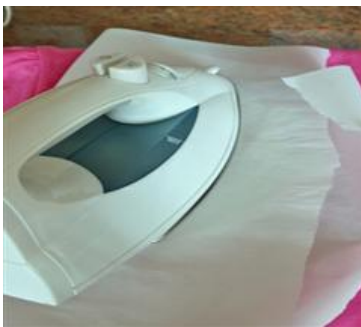
Ironing the vinyl

Peel the protective covering off the vinyl add decorations and you're done!