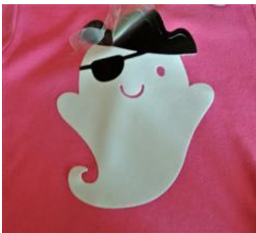
Peeling the protective covering