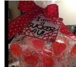
Valentines Sucker Gift Basket