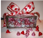
Hugs & Kisses Glass Block