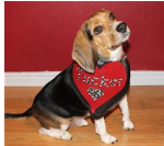
Valentine Doggie Bandana