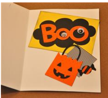
Inside of card

Run the "boo" and Bag through Swiss Dots folder. Cut yellow rectangle and striped rectangle. Edge with black ink. Glue together layers for bag and candy. Add wiggly eyes to "Boo." Adhere all elements to card face.