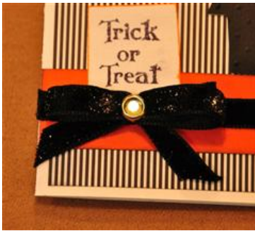
Front left ribbon

Run black ribbon around orange strip, and tie a bow with black ribbon, using brad to secure it at the center. Use red tape to secure the black ribbon.