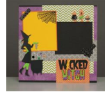
Wicked Witch Layout