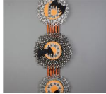
Boo Rosette Wall hanging