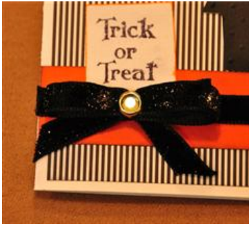
Front left ribbon

Run black ribbon around orange strip, and tie a bow with black ribbon, using brad to secure it at the center. Use red tape to secure the black ribbon.