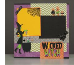
Wicked Witch Layout