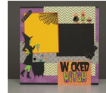
Wicked Witch Layout