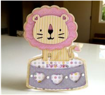
Create A Critter 2 - Lion Shaped Card

Select the shadow of the lion (3") and the base (2.25"). Copy and paste and then flip one of the images. Move it until they overlap and then weld. Cut out of white cardstock for your base.