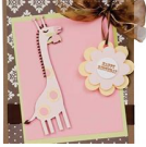
Happy Birthday Card - Giraffe