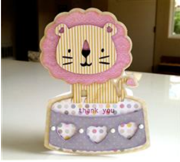
Create A Critter 2 - Lion Shaped Card

Ink all edges as desired (I used my d-stress with the inking tip) and layer using foam dimensional adhesive.