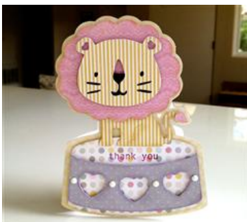
Create A Critter 2 - Lion Shaped Card

Cut all layers of the lion (3") and the base (2") out of desired cardstock.