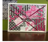
Easy DIY Bulletin Board.