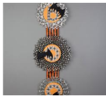
Boo Rosette Wall hanging