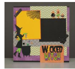
Wicked Witch Layout