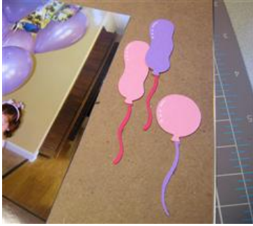
Create a Critter 2 Birthday Layout (detail)

Lastly, I placed some balloons (cut at 2 inches) on either side of my page.