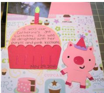
Create a Critter 2 Birthday Layout (detail)

I cut the cupcake at 4 inches and I used it for my journaling block. In the Cricut Craft Room I took away the little face on the cupcake so I would be able to write on it. I used glitter glue on the candle of the cupcake. I placed the cupcake on the right side of my page below the photo.