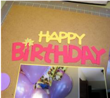
Create a Critter 2 Birthday Layout (detail)

Next I placed my title above my photo on the left side of my page. I cut the title at 2 inches and glittered the letter i (the candle). I placed the three little piggies onto my page. One on the right and two on the left. I cut the piggies at 2 1/4 inches and I used shimmery paint on their noses, hooves and ears. I put a party hat on each pig but I only put a little dress on the middle pig.