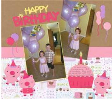
Create a Critter 2 Birthday Layout

I started by placing a strip of patterned paper across the bottom of the page. Then another thinner strip of card stock above that.