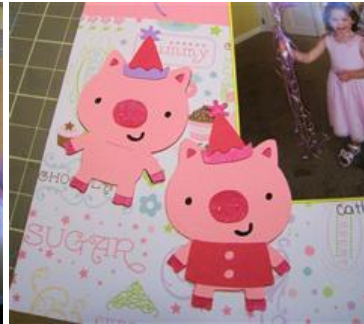
Create a Critter 2 Birthday Layout (detail)