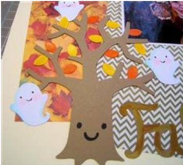
Create a Critter 2 Fall time Layout (detail)

Next, I placed the fall tree in the bottom left side of my page and my photo above it to the right. I matted my photo on white card stock. I painted the leaves of my tree with shimmery paint.