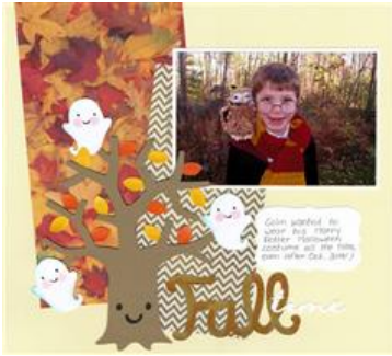
Create a Critter 2 Fall time Layout

I started by placing two pieces of patterned paper one slightly on top of the other to the left side of my page. (the paper measures 9 1/2 inches by 5 inches and 8 inches by 4 inches)