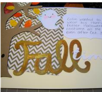
Create a Critter 2 Fall time Layout (detail)

Then I placed my title (Fall time) to the right of the tree. I painted the word Fall with shimmery paint. I also placed a top note die cut below the photo to journal on.