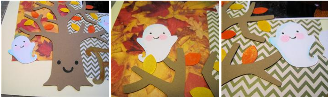
Create a Critter 2 Fall time Layout (detail) Create a Critter 2 Fall time Layout (detail) Create a Critter 2 Fall time Layout (detail)

Lastly, I added the little ghosts to my tree. I used the Pirate ghosts from CC2 but I cut their pirate hats off to make regular ghosts. I also used shimmering paint on the ghosts in pale blue for the edges and pink for the cheeks.