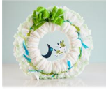
Cricut Mni® - Baby Diaper Wreath