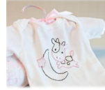
Cricut Mni® - Baby Sleeper