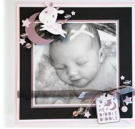
Cricut Mni® - Baby Layout