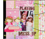
Playing Dress Up