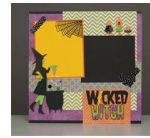
Wicked Witch Layout