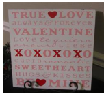
Word Collage Boards