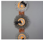
Boo Rosette Wall hanging