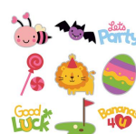
Create a Critter 2 Cartridge