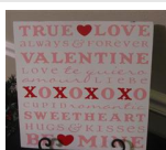
Word Collage Boards