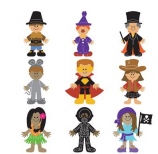
Paper Doll Dress Up Cartridge