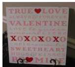
Word Collage Boards