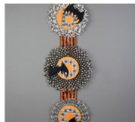
Boo Rosette Wall hanging