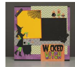
Wicked Witch Layout