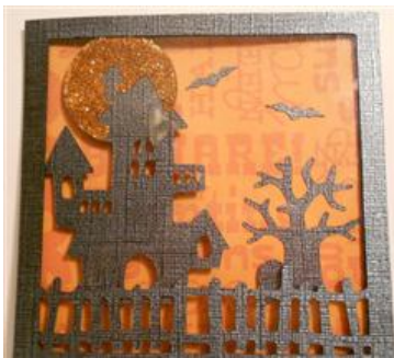
Front of Card

Then get the square house/moon cut out piece and apply Terrifically Tacky Tape on all 4 sides on the piece while it is facing up. Then remove the red peel from the tape and line up and apply the acetate sheet you cut. Now on the same cut out piece apply another layer of tape on top of the acetate on all 4 sides.