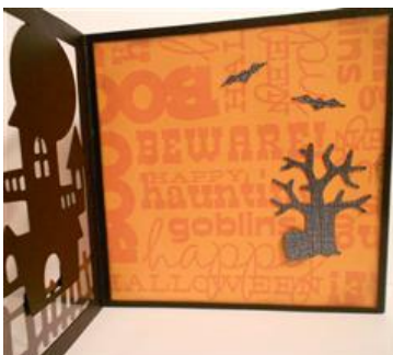
Inside of Card

Now take the card base and score the card in half.