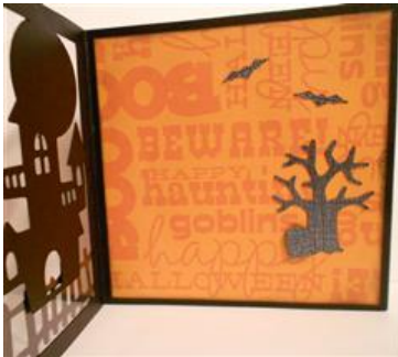
Inside of Card

Now line up the moon/house/acetate piece on the back side of the card base piece, behind the fence. Make sure to line it up well.