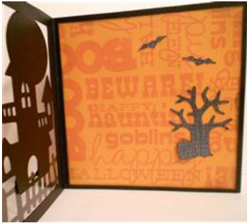
Inside of Card

Then glue your tree and bats to the card base paper. The tombstone is the piece from the house. It is the door. Use a foam dot on the tombstone.