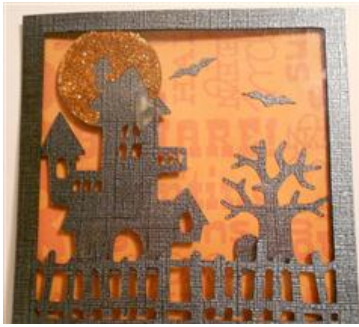
Front of Card

After downloading the cut file and opening it in Cricut Craft Room. Find the moon piece that is only part of the moon. Then add glitter to the moon and glue it to the moon/house cut out piece.