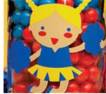
Gum Ball Jar