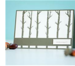
Aspen Trees Welcome Card