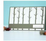
Aspen Trees Welcome Card