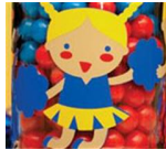
Gum Ball Jar