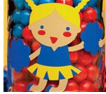
Gum Ball Jar