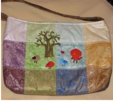
All Seasons Tote - Spring

Create basic tote of 5x5" fabric squares. Line and quilt if desired (optional). Add strap and closure as desired.