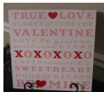
Word Collage Boards