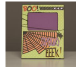
BOO! Halloween Frame