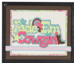
Ride 'Em Cowgirl Frame