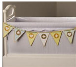
Welcome Crib Banner