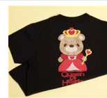
Queen of Hearts T-shirt