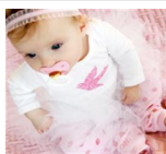
Bird Baby Sleeper