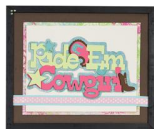
Ride 'Em Cowgirl Frame