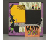
Wicked Witch Layout