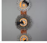
Boo Rosette Wall hanging