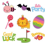
Cricut® Everyday Cartridge, Create a Critter 2