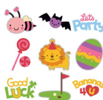
Create a Critter 2 Cartridge