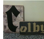
Pirate Name plaque