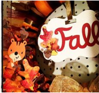
Fall Wreath Detail