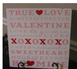
Word Collage Boards