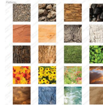
Cricut Imagine® Colors & Patterns Cartridge, Snapshot: Nature