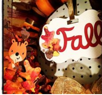
Fall Wreath Detail