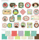
Cricut Imagine® Art Cartridge, Imagine More Cards