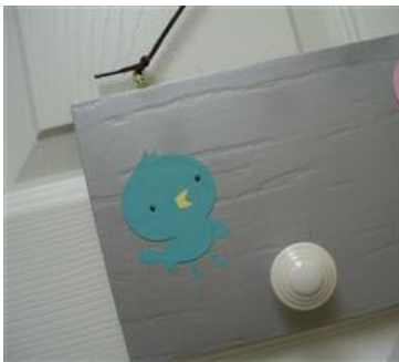
close up of left side

Using your craft glue, glue the birds to your spray painted board where you want them. Let them dry. If you want to protect your project, now is the time to spray on a clear coat of something like polyurethane or something. I did not use anything on this one.