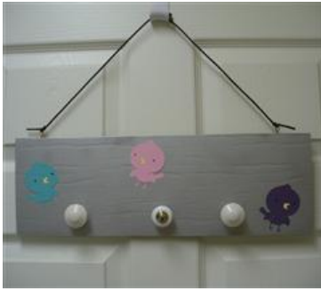
finished coat hanger

Choose your piece of laminate flooring from remnants or cut to length from the piece of wood you have available. Spray paint the front and all 4 sides your chosen color. Let dry.