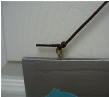
close up of knot and hook

Screw the closed cup hooks into the pilot holes that you drilled into the top edge of the board. After they are in, add a cord to hang it by. This is an old shoelace (more reclaimed materials). Use whatever you have on hand and like the look of.