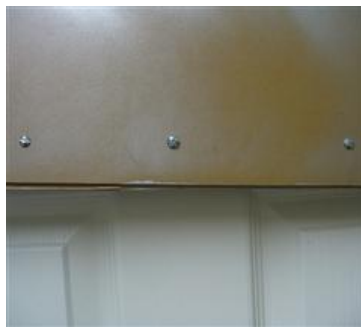
back of the board where the screws for the knobs are