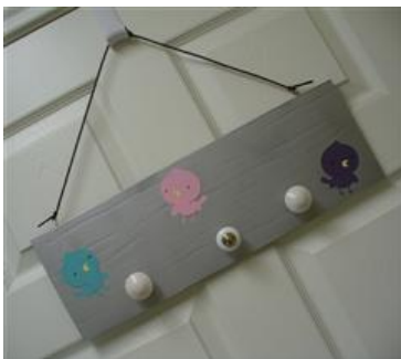
another view of the finished project

Your board is now finished and ready to use. Enjoy!