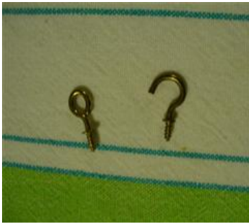
Left: after bending; Right: before bending

Now it is time to add the cup hooks. In order for the hanging cord to not come off of the hooks, you will need to close the hook down. Note the picture: the one on the right is still open and the one on the left has been closed. Using your needle nose pliers, gently squeeze the hook end toward the back side. It will close down nicely. Don't squeeze too hard or it will close up too much.