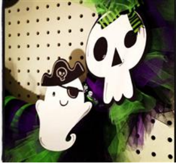
halloween wreath detail 1

Cut ghost, skull, and cloud from white card stock. Paint ghost and skull with glow in the dark paint.