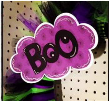
halloween wreath detail2

Cut other layers from black and patterned paper and piece layers together. Add accents with markers.