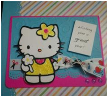
Front of Card

Cut a 4"x5.25" cardstock, punch the longer edge with a Martha Stewart Doily Lace Edge Punch. Emboss cardstock lengthwise using D'Vine Swirls Embossing Folder. The folder width is smaller than the cardstock. This is ok because it will not interfere with the Doily Lace you just punch onto the cardstock. Cut a ribbon at 6.25", wrap that across just above the Doily Lace Edge and tape it in the back with Scotch Advance Tape Glider.