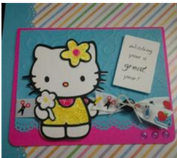
Front of Card

Glue the back of the embossed cardstock using Scotch Advance Tape Glider. Adhere cardstock to main base cardstock. Doily Laced edge faces the bottom of card. Card will be Landscape. Cut a another 2" of Michaels School Ribbon and tie a side bow knot onto the ribbon already adhered to the card. Cut the ribbon's edges in banner style. Twist bow to have decore of ribbon facing forward.