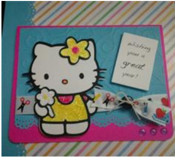
Front of Card

Add three Kaiser Scrapbook Droplets - Sky Blue to the bottom right-hand side of the card. Print front of card's sentiment using MS Word - BradleyHand ITC Font. Cut to sentiment to desired sized and adhere to the front of the card using Recollections Foam Square Adhesives.