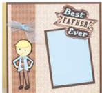
Best Father Ever layout