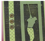
Masculine Birthday Card